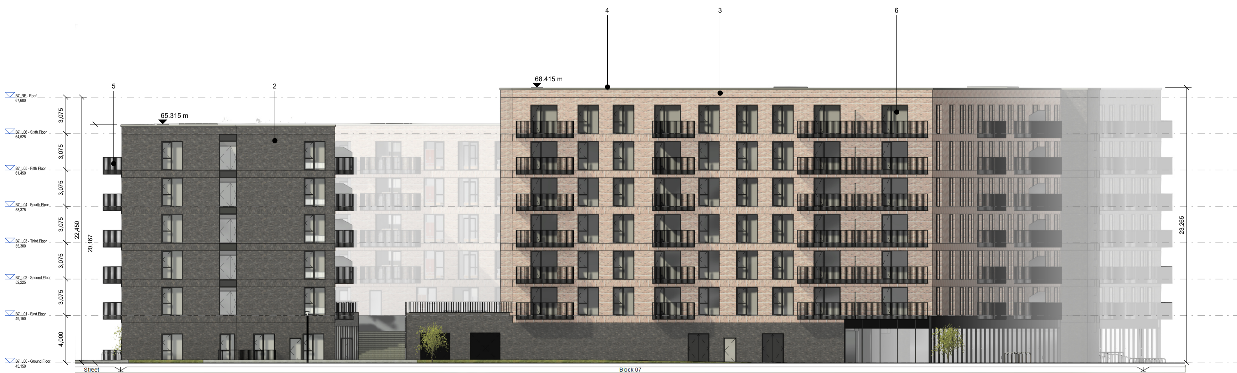
South Elevation 1 : 200

Notes: - Do not scale from this drawing. Use figured dimensions in all cases. - Verify dimensions on site and report any discrepancies to the Architect immediately. - This drawing is to be read in conjunction with the Architect's Specification. - © This drawing is copyright and may only be reproduced with the Architect's permission.