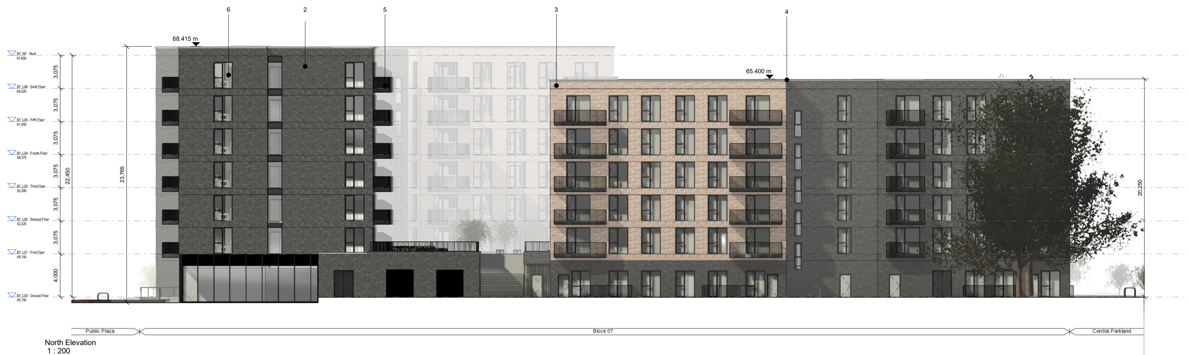
North Elevation 1 : 200